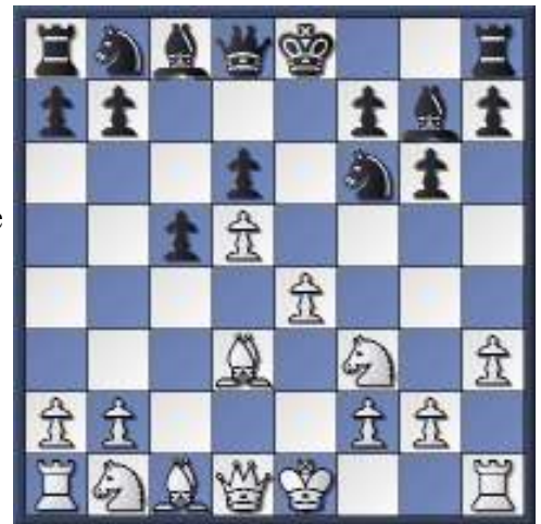
White preserves his f3 Knight with 8. h3