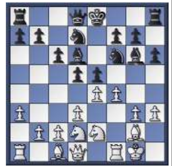
After 10 moves each

1.g3 d5 2.Bg2 Nf6 3.d3 Bf5 4.a3 e6 5.Nd2 c6 6.h3 Bd6 7.e4 Bg6 8.Ne2 h6 9.0-0 Nbd7 10.f4 e5 Dia- gram 11.f5?! Bh7 12.Nc3 d4 13.Ne2 Qc7 14.c3 0-0-0 15.cxd4 exd4 16.Nc4 Ne5 [16...Bxg3? 17.Nxg3 Qxg3 18.Bf4] 17.Nxd6+ Qxd6 18.b4 g5 19.Bb2 g4 20.h4 Nh5 21.Rc1 Rhg8 22.Kf2 Kb8 23.Rc5 Nf3 24.Bc1 b6 25.Rc4 Qf6 26.Rh1 Bxf5 27.exf5 Qxf5 28.Nf4 Ne5 29.Be4 Qf6 30.Rc2 Rd6 31.Kg2 Ng7 32.Rf1 Qe7 33.Ne2 Rf8 34.Bf4! f5 35.Bxc6 Rff6 36.b5 Nh5 37.Bxe5 Qxe5 38.Nf4 Nxf4+ 39.gxf4 Qe3 40.Re1 Qh3+ 41.Kg1 Rxc6 42.Re8+! Kc7 43.Qe1! Qg3+ 44.Qxg3 Rxc2 45.Qe1 Rf7 46.Qe5+ 1-0