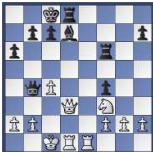
#3 White to Move