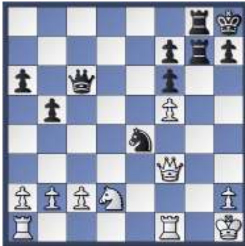
#1. Black to Move

In each diagram someone can either mate or win significant material . (For Solutions, see page 24)