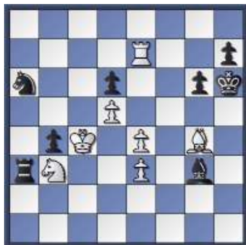
Black stands slightly better as the time scramble begins.

(Diagram Right) (Rybka wants me to play 30...Rxe4. (I was overcome by the urge to win the scary looking a7 pawn. The rest of the game quickly became a mad time scramble and I was lucky to remember as much of it as I did. 30.Nd4 cxb2 31.Rxb2 Rxa7 32.Rxa7 Rxa7 33.Kf2 Nc7 34.Rc2 b4 35.Rc6 Be5 36.Ke2 Ra2+ 37.Kd3 Na6 38.Nb3 Kg7 39.h5 Nb8 40.Rc7 Na6 41.h6+ Kxh6 42.Rxf7 Rxe2 43.Ra7 Ra2 44.Kc4 Ra3 45.Re7 Bg3 46.Bg4.....1-0 (Diagram left) (At this point Rybka gives black a -1.09 advantage. The ensuing scramble quickly got messy and I missed a very nice tactic which allowed him to promote his e-pawn. Ben is a very strong bullet player and his ability to see tactics quickly puts mine to shame. Although many of you might consider me to be a strong at speed chess I can assure you that Ben is in a totally different league!