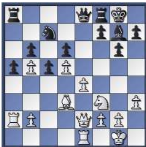
Black sacrifices the a pawn with 19... a5. Will the b and c pawn rolling compensate?

wanted to keep the Bishop on d3 to defend e4. I didn't see anything better than chopping of that bad boy on b5.) 14.axb5 Nd7 15.Bg5 Qe8 (Saving the queen seemed like a good idea. I choose e8 because it guarded e5 and pressured the b5 pawn.) 16.Bf4 Ne5 17.Bxe5 Bxe5 18.Qe2 Bg7 (I figured the bishop was stronger than the knight because of the pressure on b2.) 19.Ra2 (The plan of Re1 is very simple and would suck the life out of my position.) 19...a5! (Diagram left) (Even though Rybka thinks this is a mistake, I gave this move an exclamation because it's a very interesting pawn sacrifice. The idea is that the b and c pawns mobilize while the white A pawn remains firmly blockaded. During the game I only considered this move for about a minute and obviously I was unable to calculate all the ensuing complications However, the alternative of being slowly squeezed to death was less than appetizing. After the game I asked Ben what he thought of this move and he replied "What else?") 20.bxa6 b5 (Rybka suggest 21. Ra7 al-