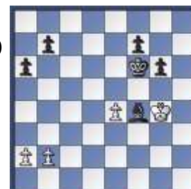
Mark gives back the piece to win. Bxf4!

1.d4 d5 2.c4 c6 3.e3 e6 4.Nc3 Nf6 5.Nf3 Bd6 6.Be2 0-0 7.0-0 Nbd7 8.h3 e5 9.cxd5 cxd5 10.dxe5 Nxe5 11.Nd4 a6 12.Bd2 Bd7 13.Rc1 Rc8 14.Nxd5 Nxd5 15.Qb3 Bc6 16.Nxc6 Nxc6 17.Bf3 Nde7 18.Rc2 Ne5 19.Rxc8 Nxf3+ 20.gxf3 Qxc8 21.Kg2 Re8 22.f4 Qc6+ 23.f3 Qd5 24.Qxd5 Nxd5 25.e4 Nxf4+ 26.Bxf4 Bxf4 27.Rf2 Rd8 28.h4 Rd2 29.Rxd2 Bxd2 30.h5 g6 31.hxg6 hxg6 32.Kg3 Kg7 33.f4 Kf6 34.Kg4 Bxf4 (diagram) 35.Kxf4 g5+ 36.Kg4 Ke5 37.Kxg5 f6+ 38.Kg6 b6 39.b3 a5 40.a4 Kxe4 41.Kxf6 Kd4 42.Ke6 Kc3 43.Kd5 Kxb3 44.Kc6 Kxa4 45.Kxb6 Kb4 0-1